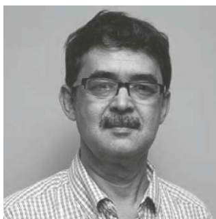
SUDIPTA BASU SOUND RECORDING & DESIGN